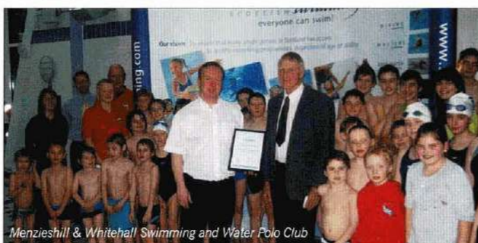
Menzieshill & Whitehall Swimming and Water Polo Club

A full review of the programme was undertaken in 2008 with recommendations put forward with the aim of aligning SwiMark with other Scottish Swimming programmes, whilst developing a streamlined and workable process that can be delivered positively by Scottish Swimming and by volunteers within clubs.