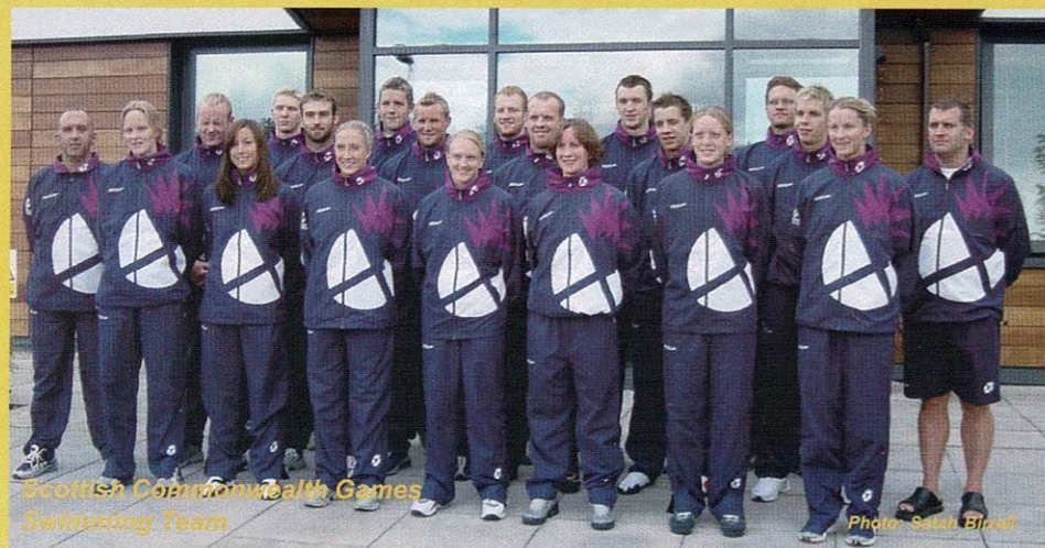
Scottish Commonwealth Games Swimming Team