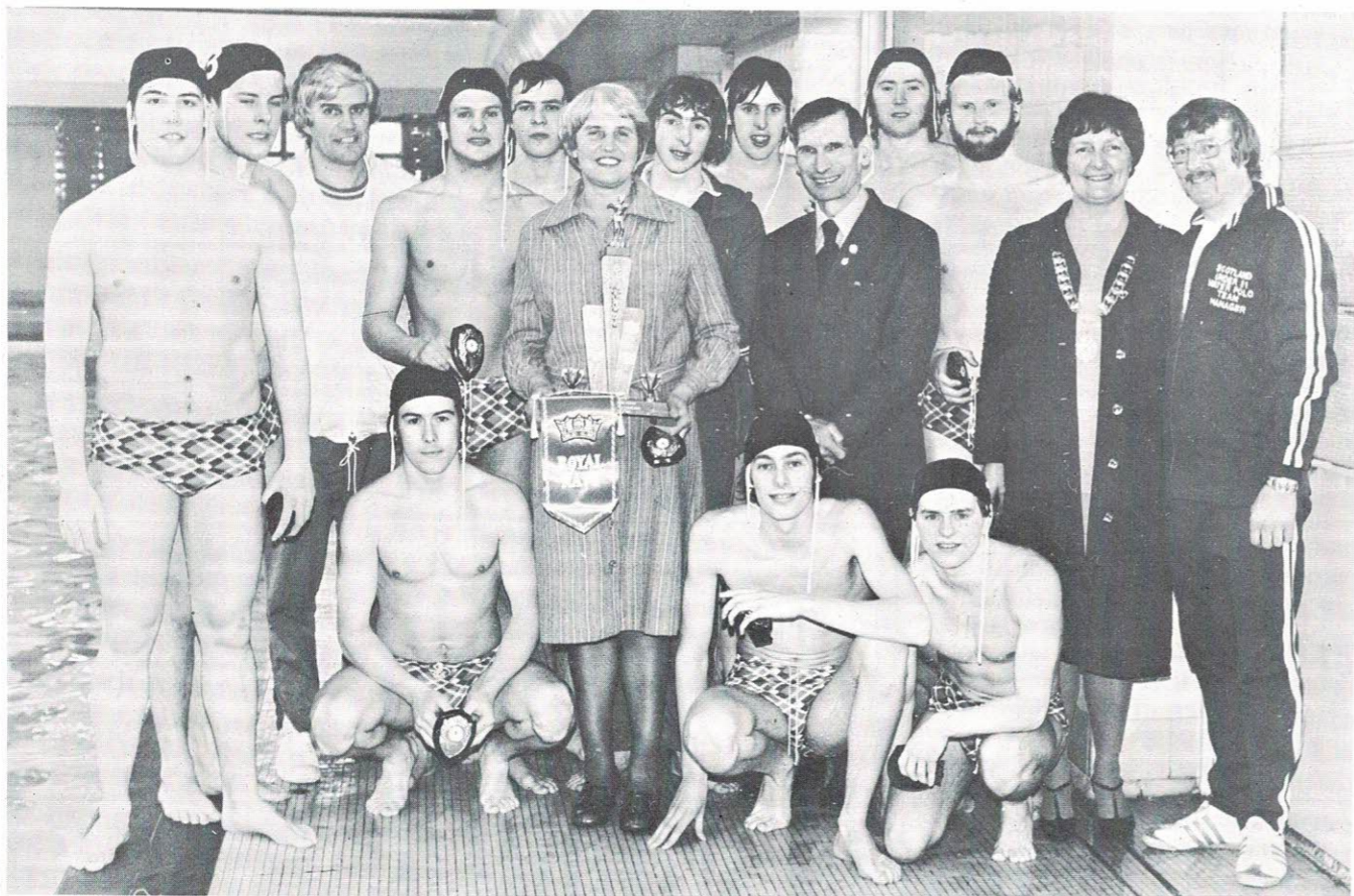
Willie Mellors Quadrangular Tournament Rosyth 10th April, 1976.