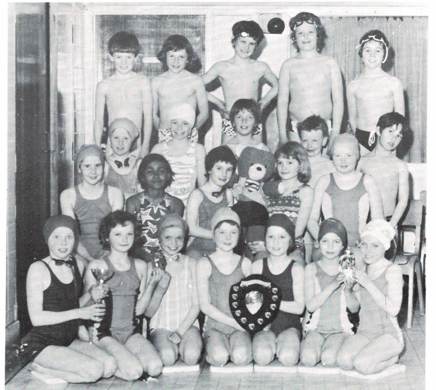
Members of Aberdeen Dolphin, at the Age-Group Mini Gala, Grangemouth.