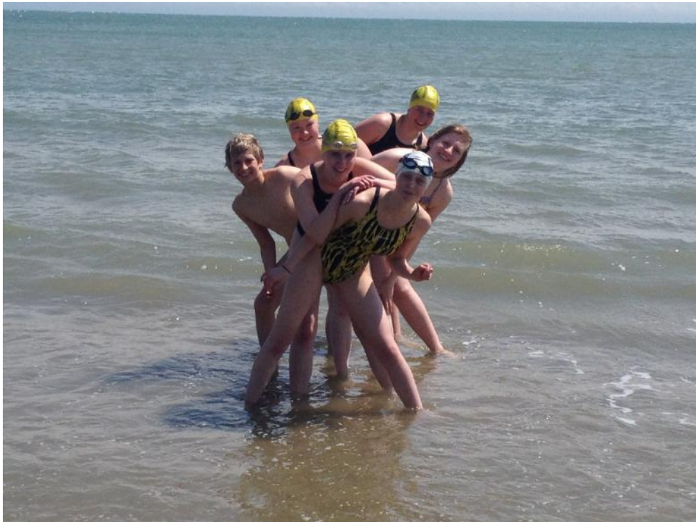
The team before a training session on Folkestone beach